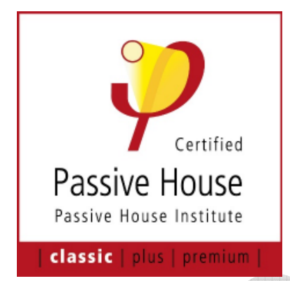
Passive House seal

Subject to a thorough quality check, buildings can be certified in accordance with the criteria for the respective energy standard as mentioned in Section 2. If the technical accuracy of the required documentation for the tested building is confirmed in accordance with Section 3.2. and the criteria in Section 2 are fulfilled, the respective applicable seal will be issued.