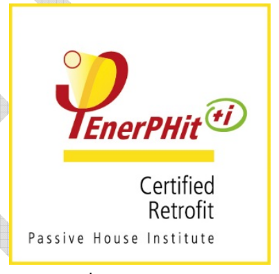
EnerPHit*i seal (for buildings with mostly interior insulation)